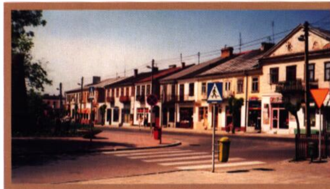
Former Jewish region, now part of town square, 1997