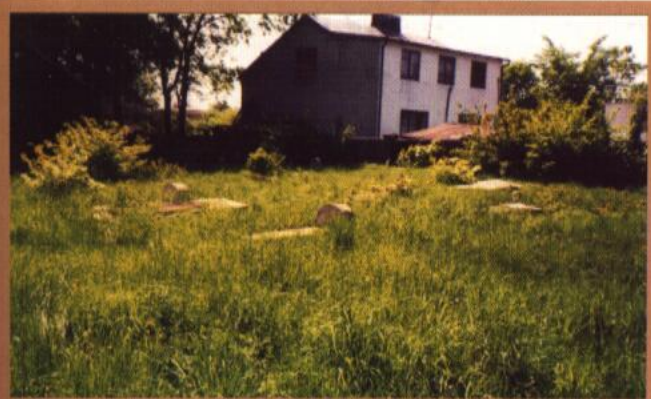
ul. Brzeska 60, Jewish cemetery, 1997