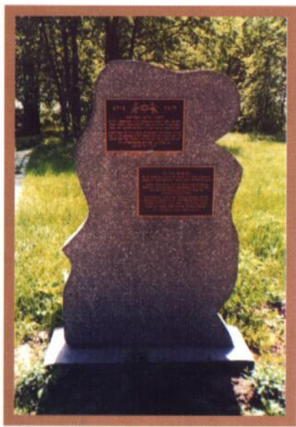
ul. Brzeska 60, Jewish cemetery, 1997; Holocaust monument

Monument to Jewish victims from Mi3dzyrzec and surrounding towns.