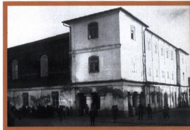
Synagogue, c. 1919

ul. Nassuta, Poprzeczna and Nadbrzeżna Synagogue destroyed during the Holocaust. Current site use: apartment complex.